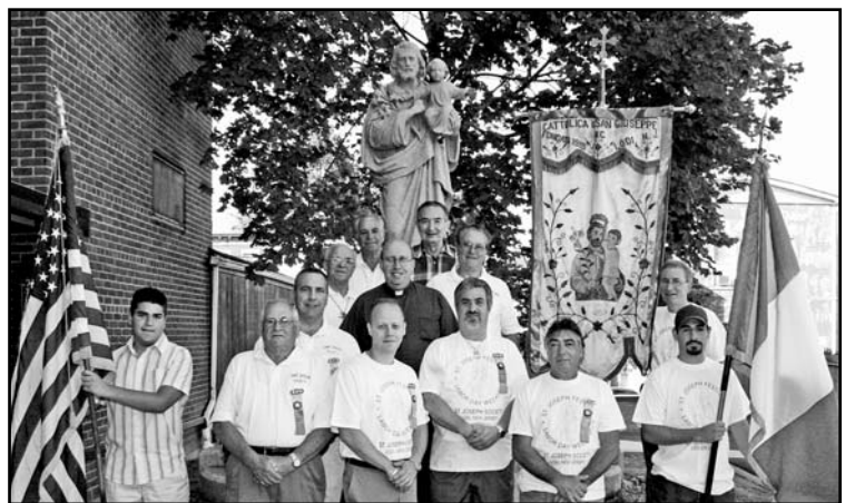
St. Joseph Society members.