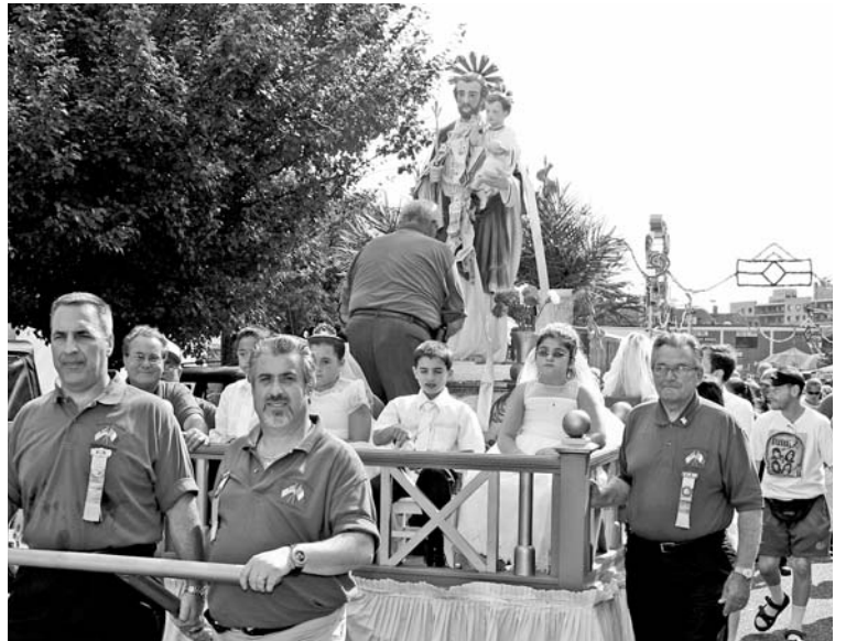
St. Joseph Society takes the float throughout Lodi.