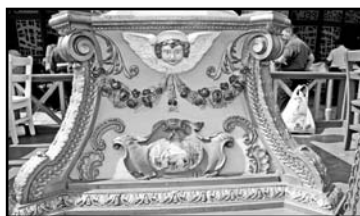
The original St. Joseph Statue base.